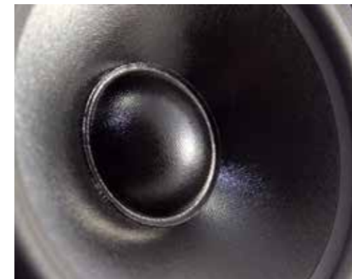
Bonding of dust cap with membrane