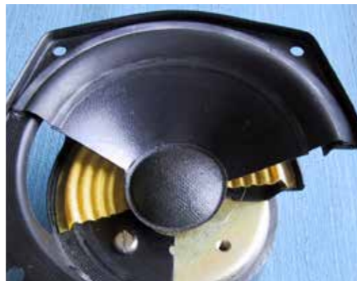
More bonding areas