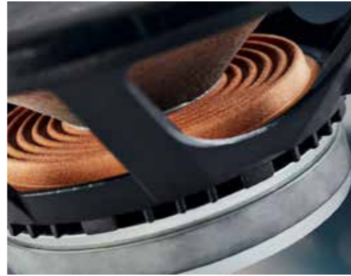
Bonding of pole plate, ferrite ring, front plate and basket