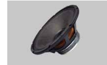
Project: Bonding of rubber gasket

Benefit: 30 % gain in time by fast strength build-up after pot life