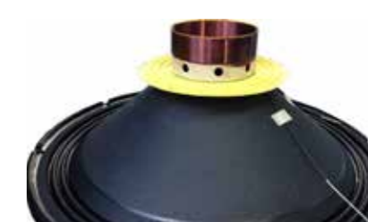
Project: Bonding of damping with voice coil and membrane

Benefit: Mixing ratio 1:1 - safe for automatic dosing