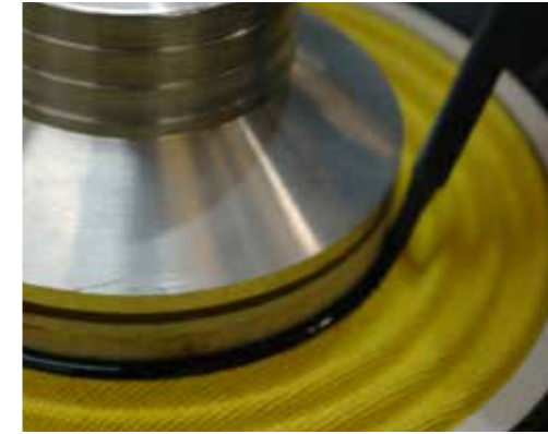
Bonding of damping with voice coil